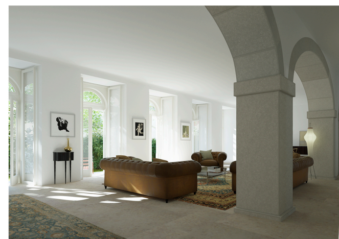
Living room detail

The room areas indicated are measured by the inside perimeter of the walls and include the areas of the cabinets and closets